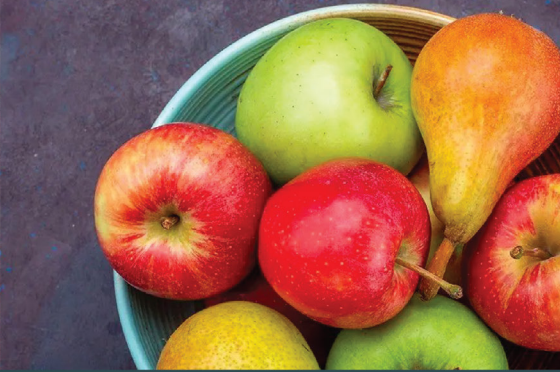
Apples & Pears